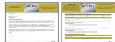
Modern Class Gold and Center Plate Collection Resume/Cover Letter Design Template