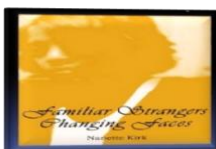
Familiar Strangers Changing Faces Fiction Novel by Nanette Kirk available at lulu.com