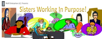
Sisters Working In Purpose Brand