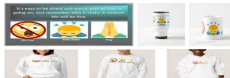
No Fear. Bow Down. Pray. Promo Products at the NetKi_Enterprises store at zazzle.com