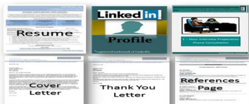
$700 Premium Branding Package Best Value: Save $130