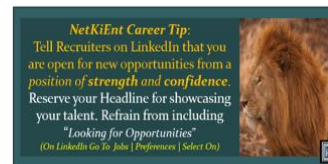
NetKiEnt Career Tips e-books coming in 2017