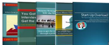
Free Career Resources