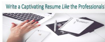
Online Resume Writing Course at our Netkient learn and thrive store at Thinkific.com