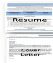
$410 Foundation Package Value: Save $40

* We also customize packages and have additional services such as interview prep, resume critique. All packages include Complimentary Next Steps and Recommendations