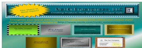
Business card designs at our NetKi_Enterprises store at zazzle.com