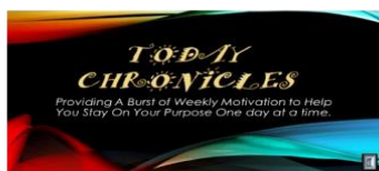
Today Chronicles Motivation Brand e-book in 2017

We have the perfect Gift for just about everyone!