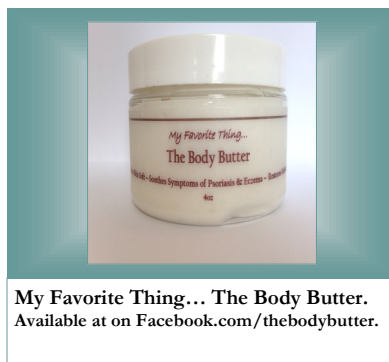
My Favorite Thing... The Body Butter. Available at on Facebook.com/thebodybutter.

weddings and fashion shows. I always had an interest in skin care and beauty, make up artistry lessons at department stores and that parlayed into becoming a licensed aesthetician; doing facials. Being in beauty, I began to research products possible ingredients and things. I've always enjoyed Bath and Body Works; loving the different smells. I found that while the lotions went on well, they would dry up so much on my skin as if I