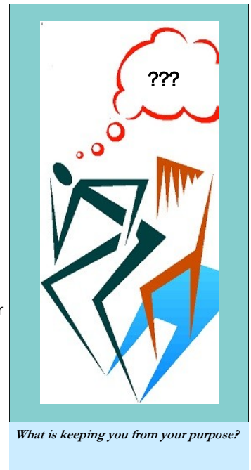
What is keeping you from your purpose?

You hear it all of the time. A wall street broker, high priced attorney, successful business person, all deciding to leave the rat race and pursue a different career path. Maybe they suffered burnout, their health started to deteriorate or they were forced out by budget cuts. At the end of the day, the