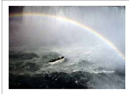
Even during the darkest times, God has a way of showing us He is There.

"Always be positive. Live today in a way that when tomorrow comes, the memories of yesterday will always be cherished ones."